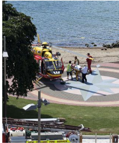
FLOWN TO HOSPITAL: An injured passenger from one of the two boats involved in a Marlborough Sounds collision is loaded aboard the Westpac Rescue helicopter to be flown to Wellington Hospital.

An afternoon on the water turned into a horror experience for students on an Outboard Bound cutter after it collided with a dolphin watch catamaran in the Marlborough Sounds and began sinking yesterday afternoon.