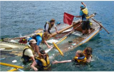
HIT: People from an Outward Bound Cutter boat in the water near Picton Harbour after being hit by a Dolphin Watch boat. ALISON KIELSO

A police spokesman said the students, who were paddling near Wedge Point, saw the Dolphin Watch Ecotours boat approaching and tried to alert the skipper they were on a collision course but to no avail. The catamaran rammed into their boat, throwing the students into the water.