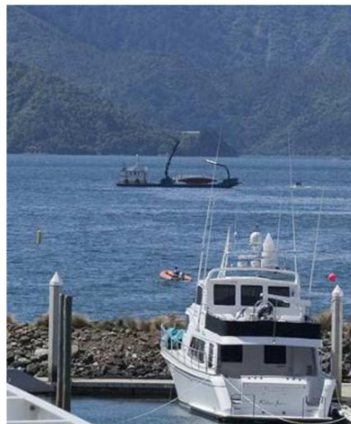
RESCUE WORK: One of the boats involved in the Marlborough Sounds collisions is lifted onto a barge. CLAYTON MORGAN

Other boaties raced to pluck the students from their fast-sinking vessel. All aboard the cutter were wearing lifejackets.